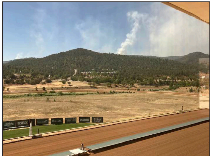
Wednesday afternoon at Ruidoso Downs.